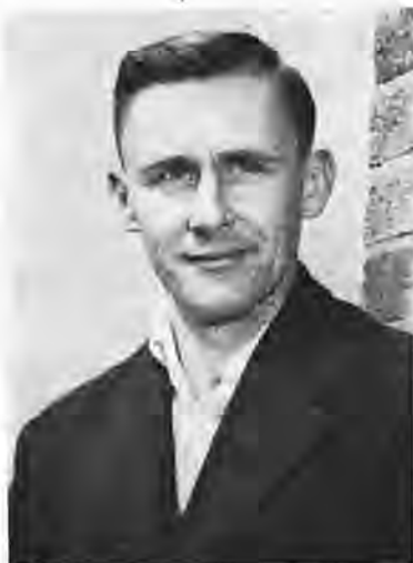
TABLE TENNIS HELPS MY CRICKET